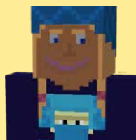
Unsafe Behaviour Character

These appear at each of the crossing locations. Each has a story about some unsafe behaviour that they have displayed at the crossing.